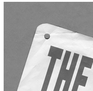
THE THUMB-SAVING PRE-PUNCHED HOLE FEATURE

seems someone from every team pierced their thumb trying to get the metal lance on the end of their bib elastic through the tough number bib. Instead of blood trails in the snow combined with cries and curses it was all smiles since the new bibs had a pre-punched hole to accommodate the elastic bands. Last year's bibs had no hole for the elastic. The metal retainer at the end of the elastic had to be forced through the Tyvek bib material. This retainer came sharpened just for that purpose and is reminiscent of a lance phlebotomists use to draw blood samples from fingertips. As it turned out, this is just what it did when used in combination with cold fingers, bulky clothes that stretched the elastic band and the hurried atmosphere of the race.