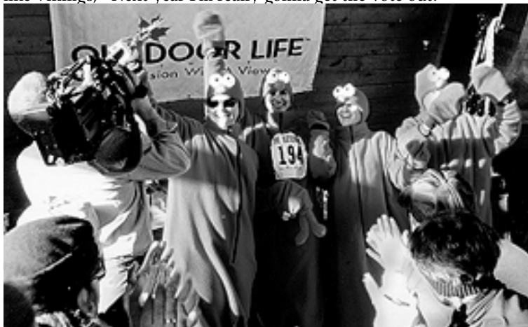
The Four Elmos of West Warwick, RI, pose in their red outfits for the video camera and the crowd at the awards ceremony. The team won first place in the costume contest.

There were bitter feelings from some teams that fell short on the votes. On the one hand they lost, but on the other hand it wasn't clear if anybody broke any rules, even though they may have broken with tradition. "I didn't know people were going to stuff [the ballot box] like that." Said one female member of a team that looked a lot like Vikings, "Next year I'm really gonna get the vote out!"